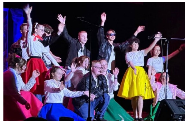
The Arcadia High School Choir performs "Back to the 50's"