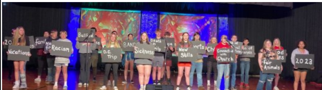
The Arcadia Junior High Choir performs "Seasons of Love" from the musical "Rent"

We are looking forward to next fall and hope that you will plan to attend all of our concerts and performances.